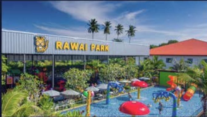
Children's amusement park