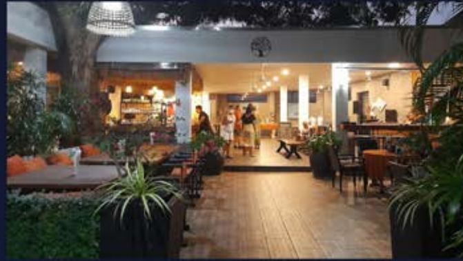
Cafés, restaurants, bars