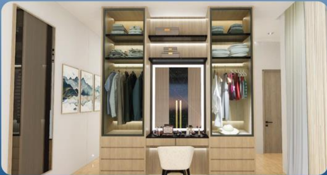
Walk in closet Type A