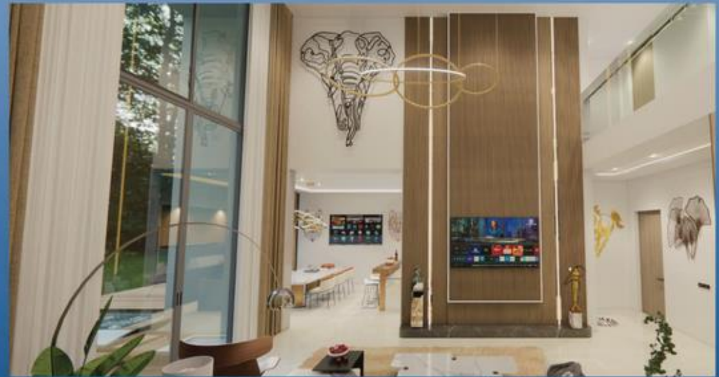
Living Type A