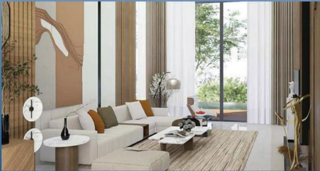
Living Type A