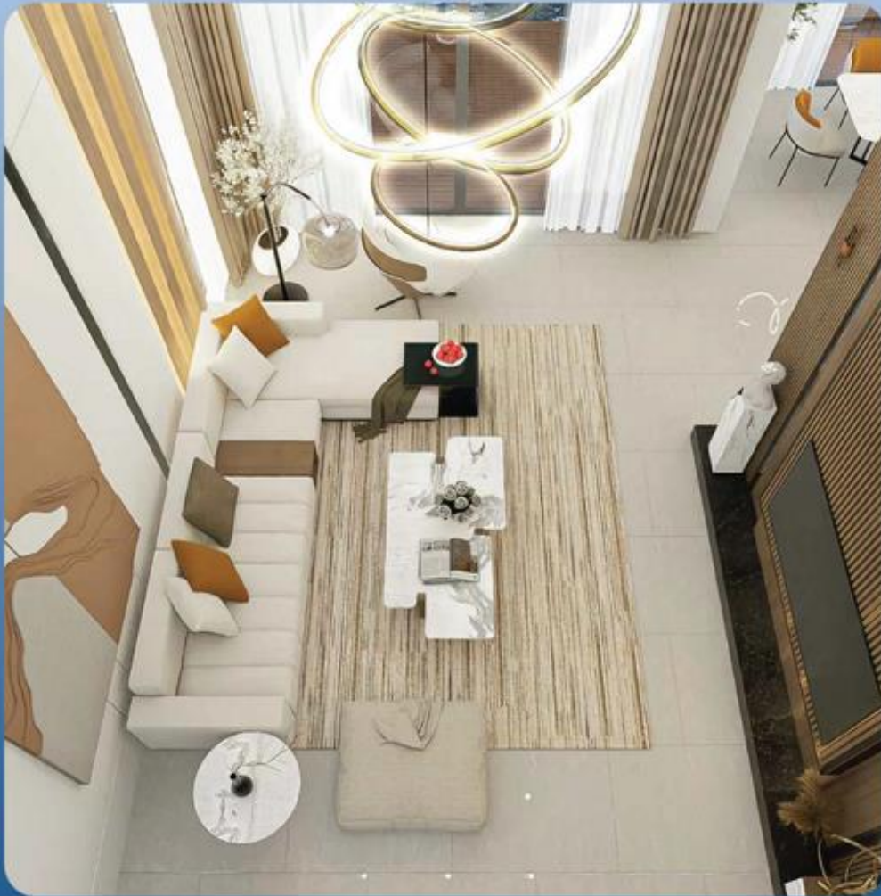
Living Type A