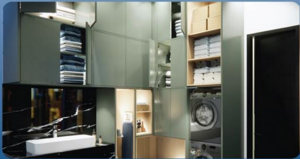
Laundry Type A