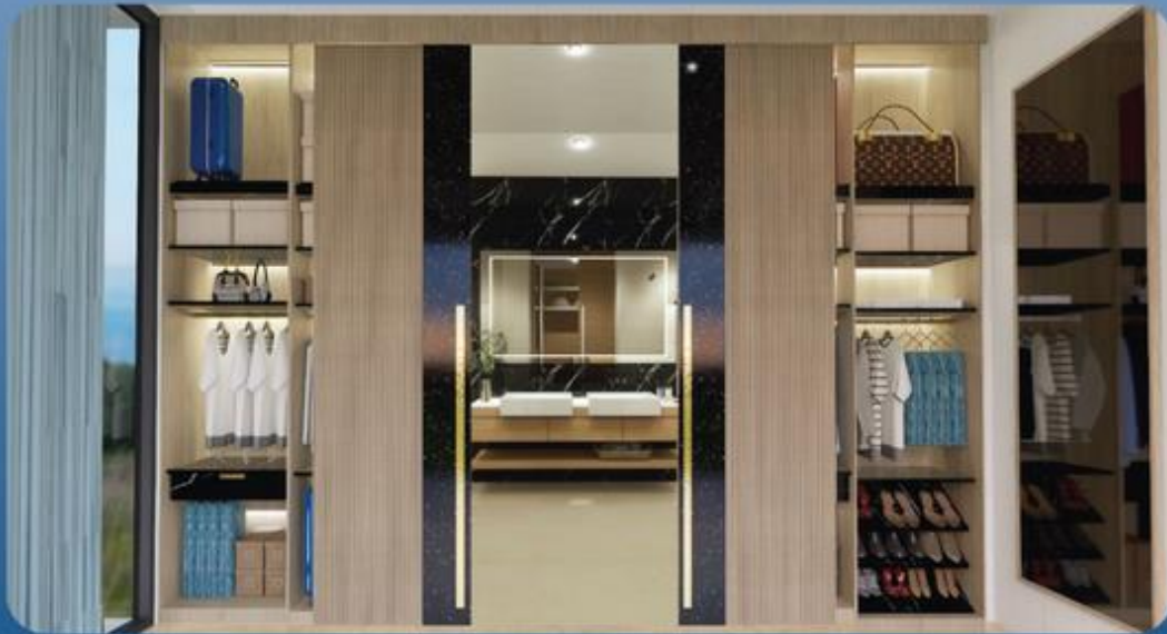
Walk in closet Type A