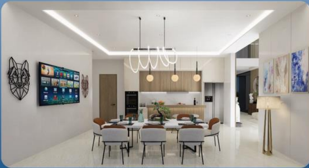
Kitchen - Dining Type A