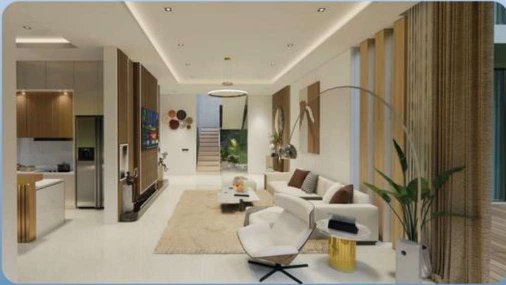
Living Type A