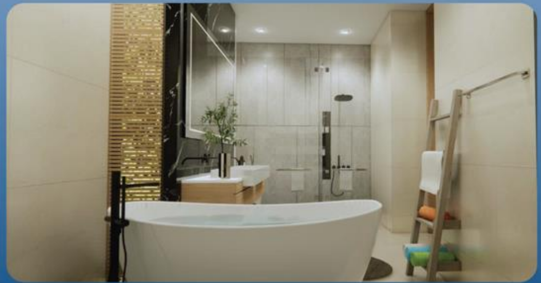
Bathroom Type A