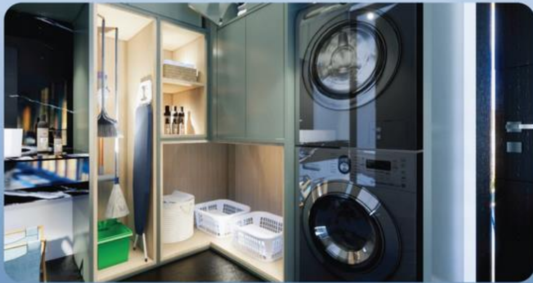
Laundry Type A